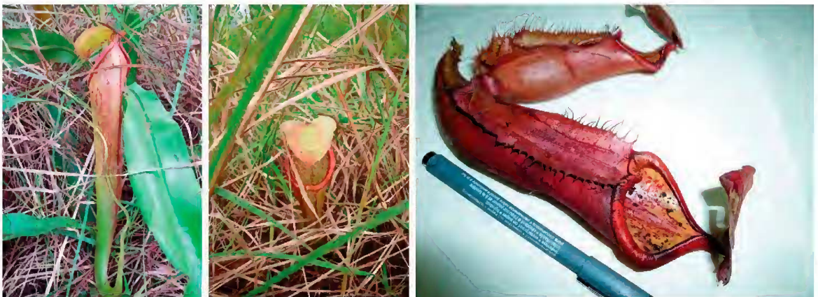
Figure 4: Nepenthes smilesii pitchers in nature (left & center). The two pitchers on the right were used for study in the laboratory.

The dominant species is a background species for the study area from Dolichoderinae, Technomyrmex yamanei Bolton, 2007 (Fig. 7, image 1). Quite numerous colonies of this species inhabit